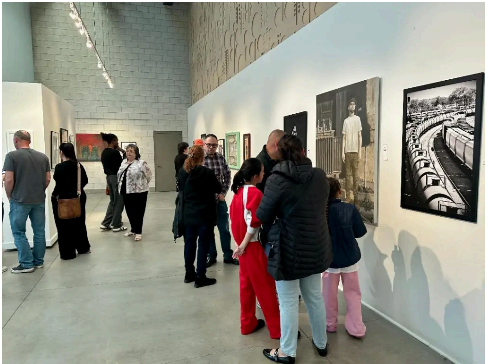
Artists and neighbors gathered at the Beverly Arts Center for its 48th annual Art Comp on Friday, May 9, celebrating local talent with awards and community pride.